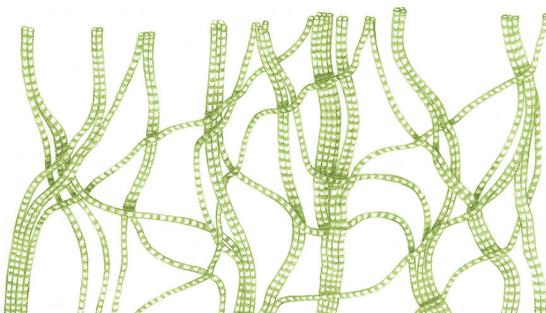
Illustration of collagen meshwork